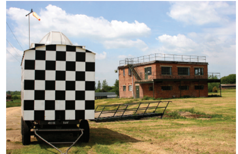
Operations caravan and the Control tower, now a museum, at Debach.