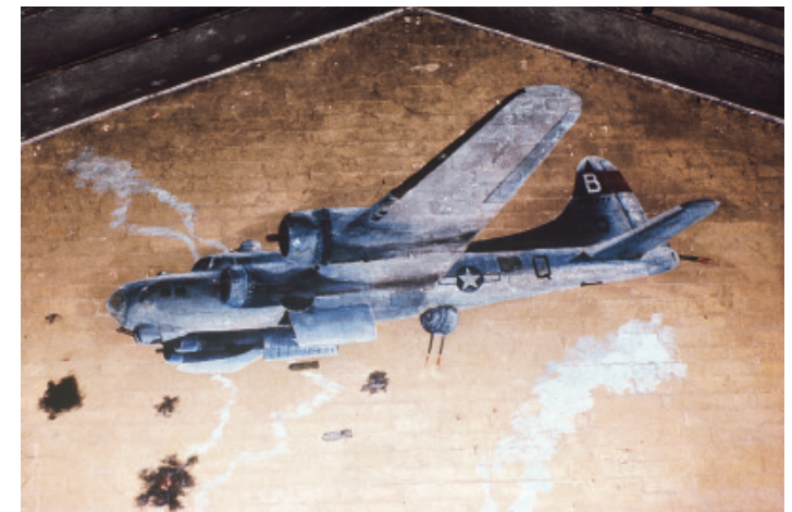
B-17 mural which once adorned a wall at Podington and is now at the IWM, Duxford.