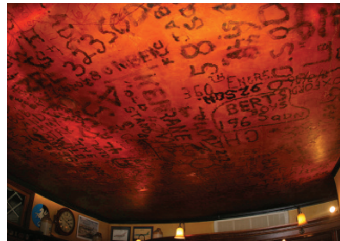
Above: Signatures and squadron numbers smoked on the ceiling of the Airman's bar in the 'Eagle' in Benet Street, Cambridge.